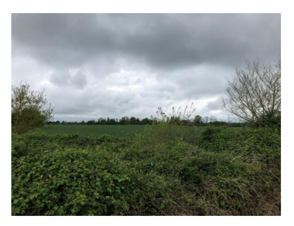
Photo 4 – Scrubland / agricultural fields south of the west of the A47