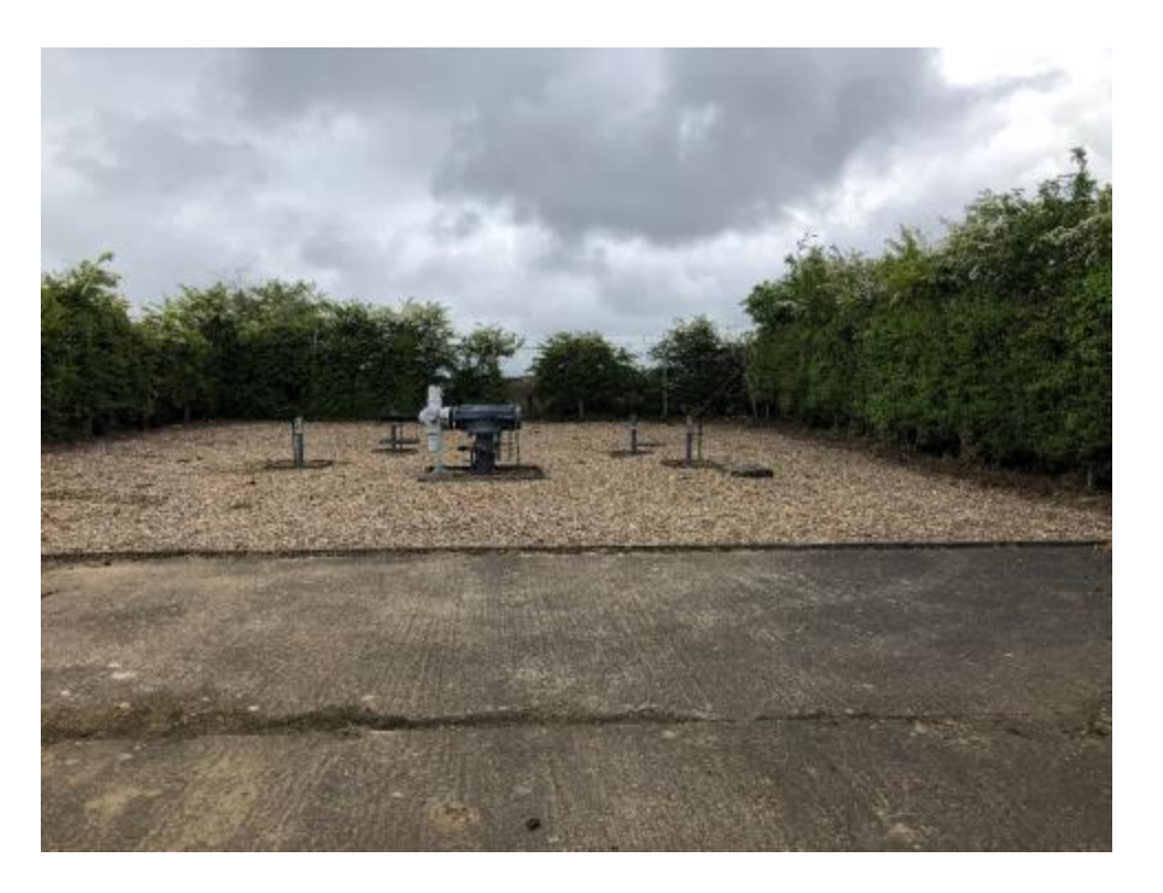
Photo 11 – National Grid Gas Valve Compound 290m west of A10 on Chequers Lane