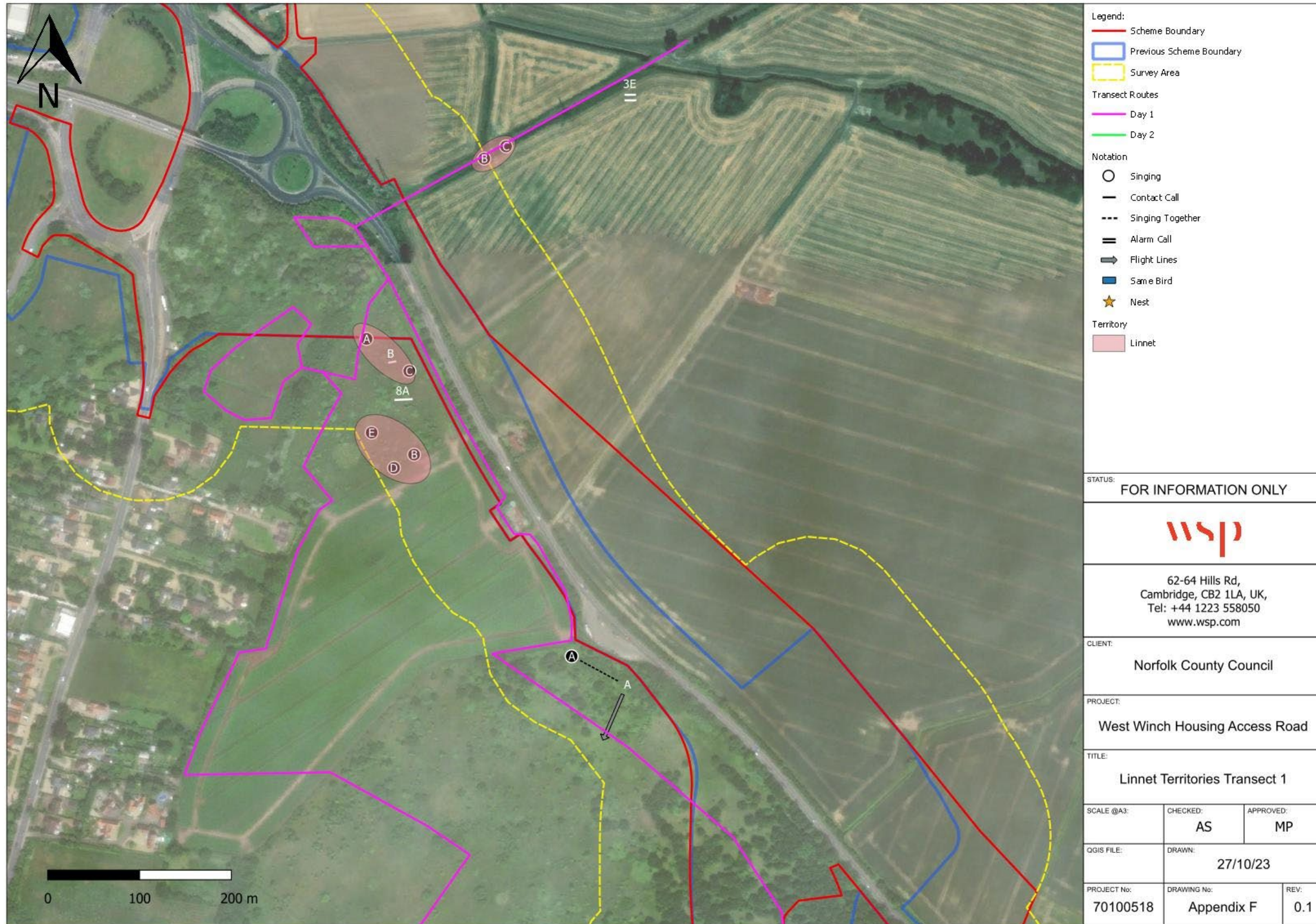
Figure 1-1 – Linnet territories