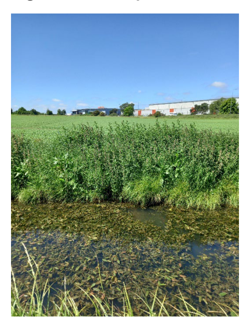
Figure 1-4 – Pierpoint Drain upstream survey extent – looking downstream