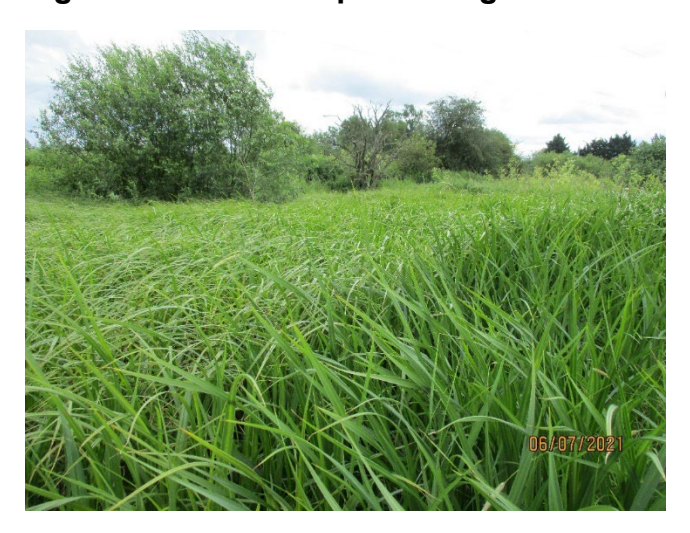
Figure 1-10 – False fox sedge growing within greater pond sedge at area 3