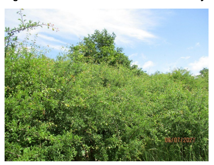
Figure 1-18 – Hawthorn-dominated boundary scrub at area 5