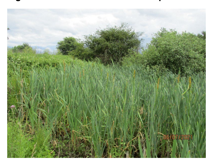
Figure 1-12 – Homogeneous area of neutral grassland at area 3