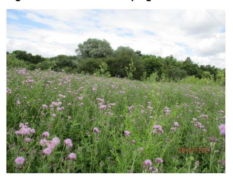
Figure 1-16 – Non-NVC type vegetation dominated by wood small-reed at area