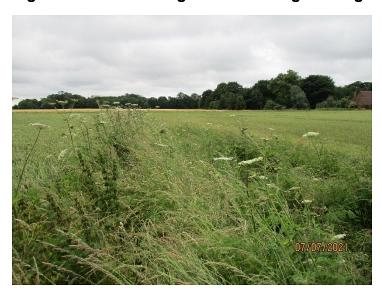
Figure 1-24 – Neutral grassland field to south of Rectory Lane