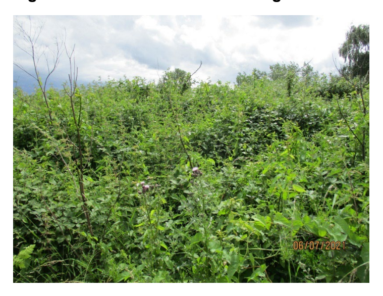
Figure 1-14 – Hemlock overtopping nettles and bramble at area 3