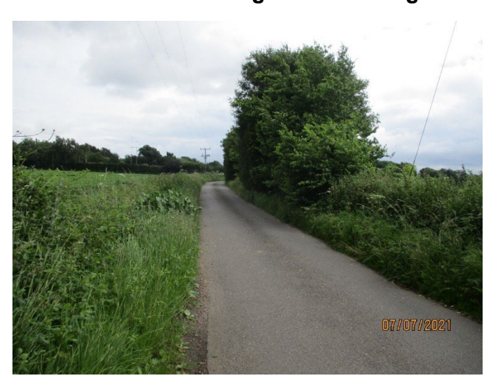
Figure 1-26 – Neutral grassland along drainage ditch to south of Chequers Lane

Figure 1-25 – Area 11 with neutral grassland along northern verge and trees/shrub along southern verge