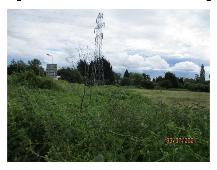
Figure 1-4 – Bramble-dominated section along boundary of area 2