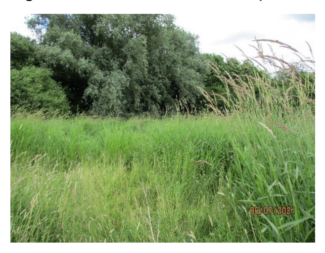
Figure 1-6 - Grey willow scrub growing over swamp vegetation at area 3