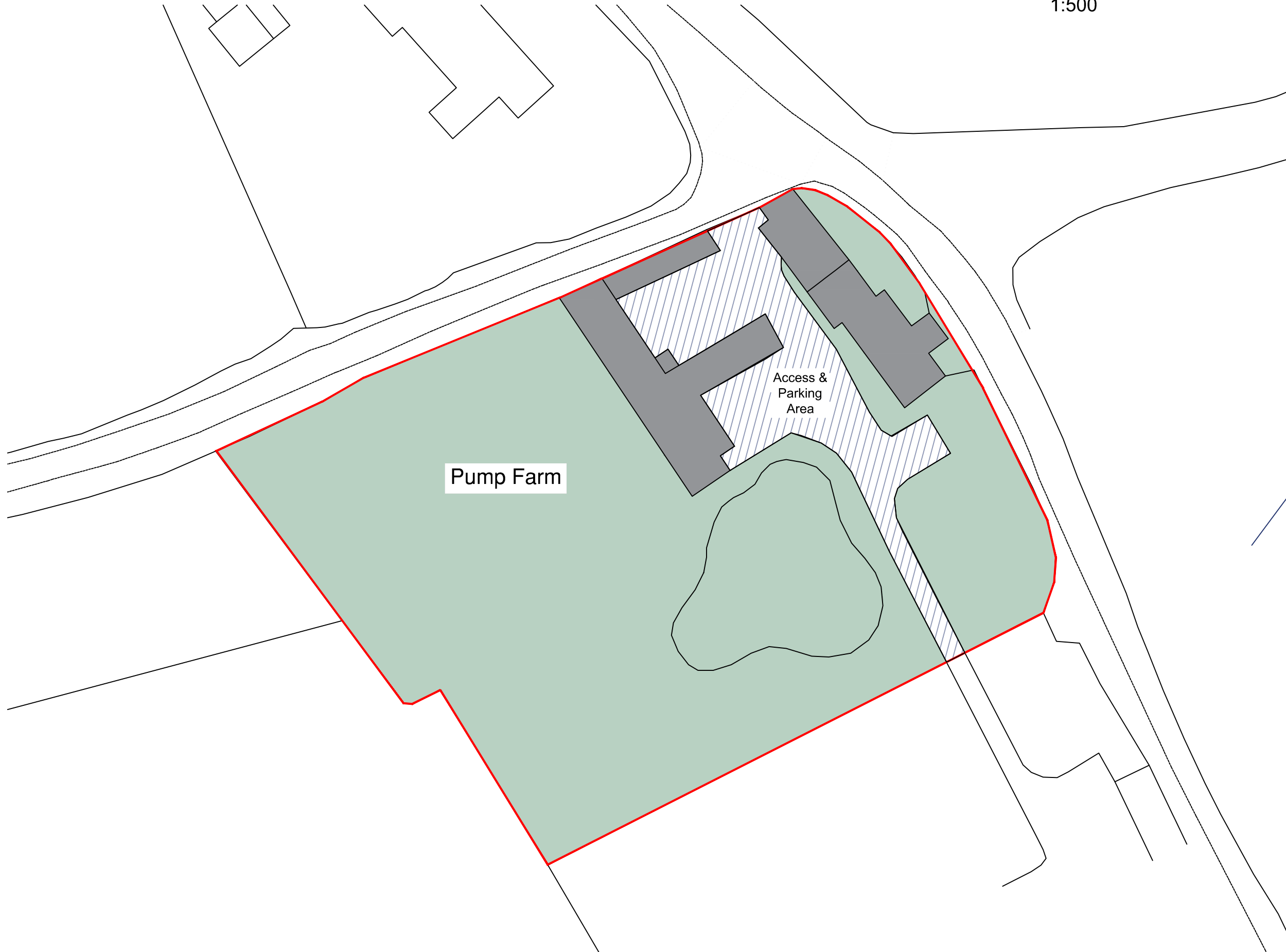
Site Plan (1:500)