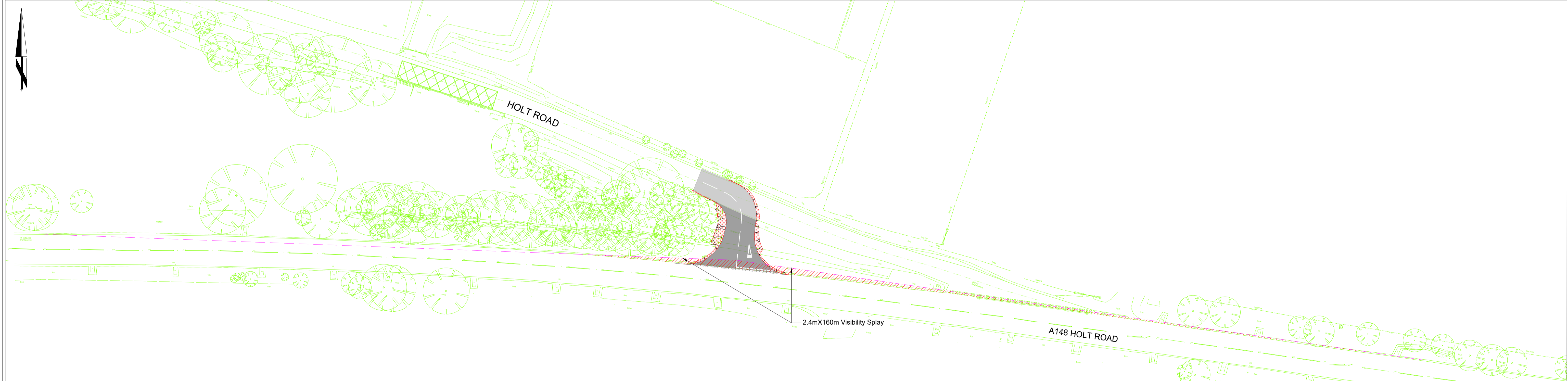
VISIBILITY SPY SCALE 1:500